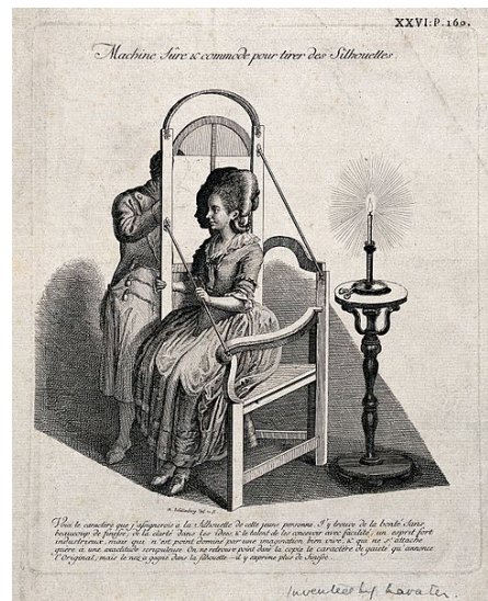
A Traditional Silhouette from the 18 th Century.